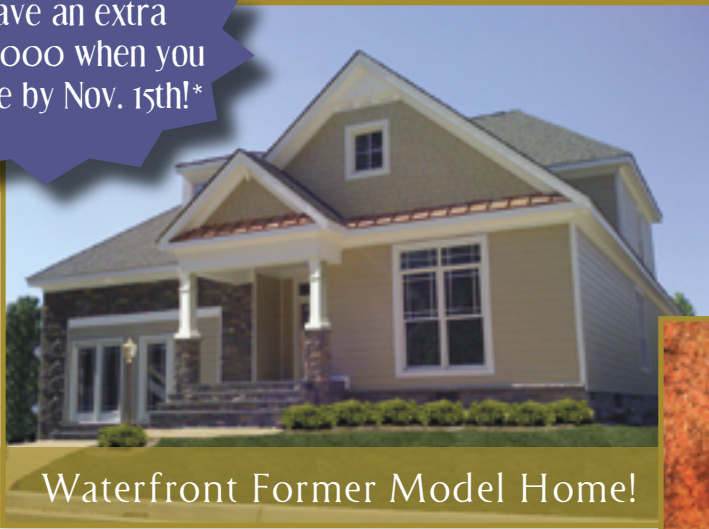
Waterfront Former Model Home!

Save an extra $40,000 when you close by Nov. 15th!*